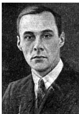
before Stalinist GULAG

Szkic bibliograficzny na Nikolai Aleksandrowicz Kozyriew (1908-1983)