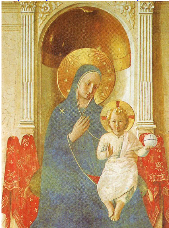
Fra Angelico—Virgin and Child (San Marco, Florence)

It was known to the ancient Persians, and this was confirmed by Rudolf Steiner (1861-1925), that the star of Zarathustra is Sirius, the brightest star in the heavens—the sidereal longitude of which is 19\frac{1}{2}^\circ sidereal Gemini—hence the appropriateness of the name “radiant star.” There is much that could be said about this Bodhisattva individuality, who was the bearer of the Archangel (Folk Spirit) of Ancient Persia, and perhaps the most significant thing of all was communicated by Rudolf Steiner: that Zarathustra later reincarnated as the child Jesus whose birth is described in the Gospel of Matthew, who was visited by the three kings (Magi), who themselves were reincarnated disciples of Zoroaster (the Greek name for Zarathustra), and that since that time, in his subsequent incarnations—one in almost every century—is known as the Master Jesus .